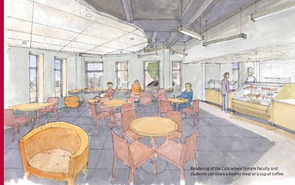
Rendering of the Cafe where Temple faculty and students can share a kosher meal or a cup of coffee.